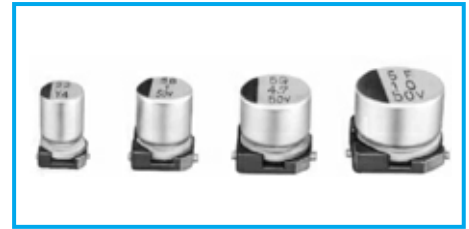
Marking color : Black print